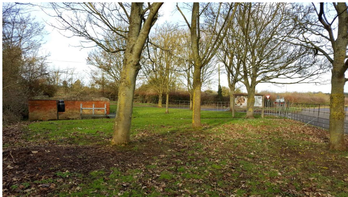
Taken in January 2018